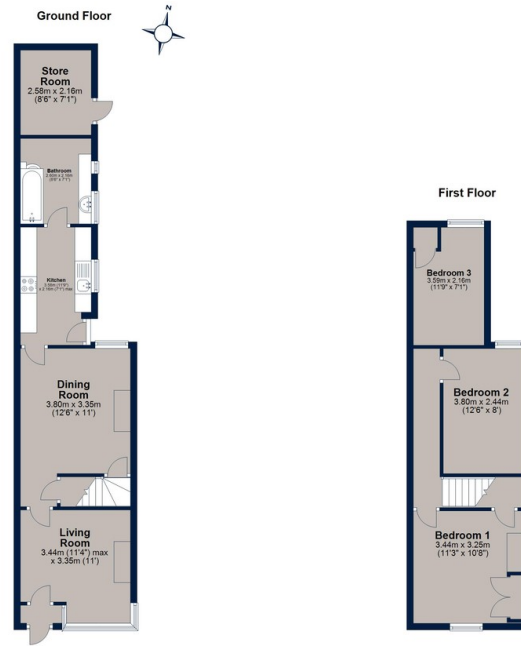
Total area: approx. 82.9 sq. metres (892.0 sq. feet) Plan is for illustration purposes only and may not be representative of the property. Plan is not to scale. Plan produced by M-Photo Plan produced using PlanUp.