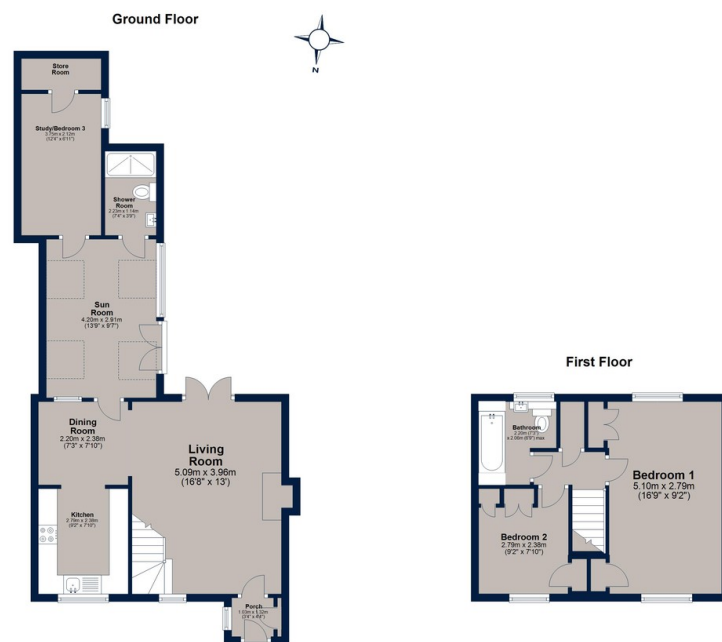
Total area: approx. 92.9 sq. metres (1000.4 sq. feet) Plan is for illustration purposes only and may not be representative of the property. Plan is not to scale. Plan produced by M-Photo Plan produced using PlanUp.