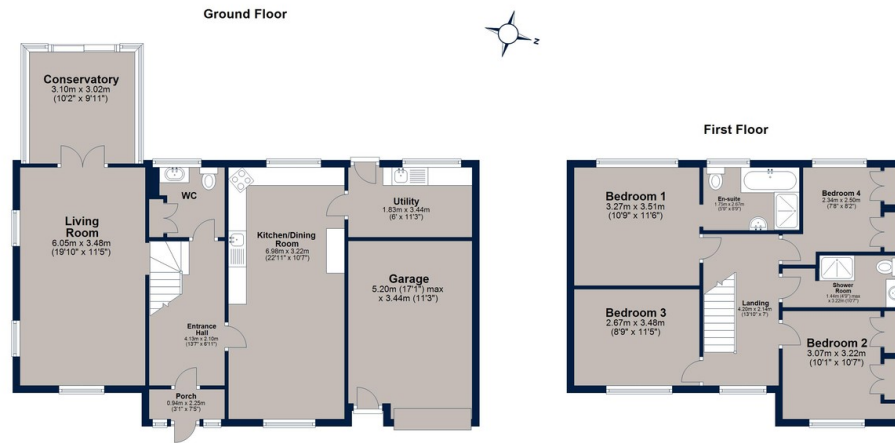
Total area: approx. 151.5 sq. metres (1630.4 sq. feet) Plan is for illustration purposes only and may not be representative of the property. Plan is not to scale. Plan produced by M-Photo Plan produced using PlanUp.