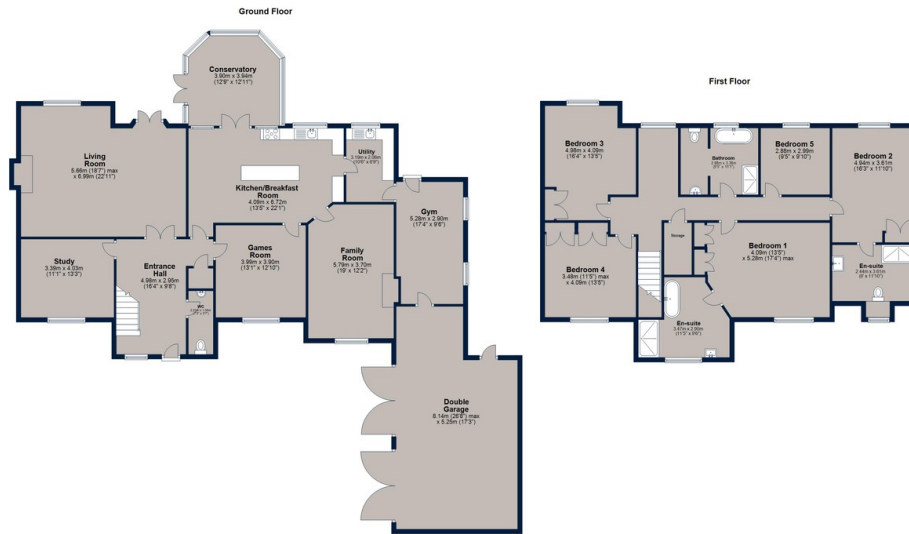
Total area: approx. 351.8 sq. metres (3854.9 sq. feet) Plan is for illustration purposes only and there will be variations at the property. Please contact us for more information.