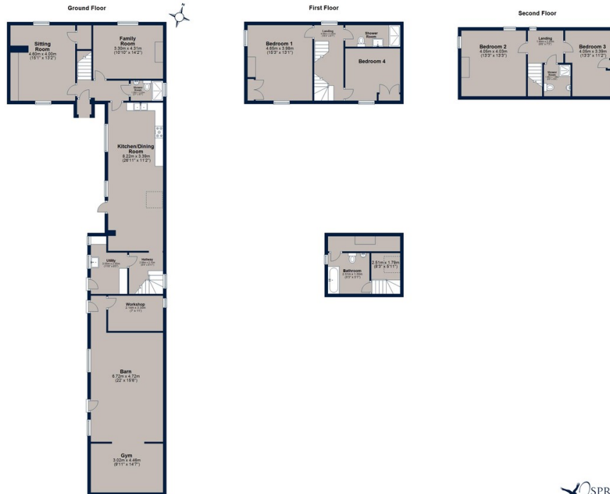
Total area: approx. 243.4 sq. metres (2620.2 sq. feet) Please see Auction conditions only and this will be reproduced in the Auction. Plans for info only. Not produced by us. Plans for production only.